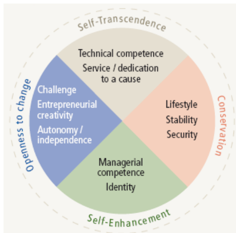
Figure 1. Circular model of Career Anchor Structure. Wils et al. 2010.

The main purpose of this research was to examine the differences pedagogy students' and special education students' values. In the context of values as career guides [5] it is important to analyse differences between regular teachers and special education teachers. In Poland, special education teacher is the least prestigious occupation associated with education [6]. Also, a risk of burnout is higher among special education teachers [7][8]. Existential hardness is one of the main problems associated with it. The engagement and effort put into the work does not always give satisfying results and the employees receive less gratification. Special education teachers are working in much less controllable conditions with less instruments of influence. Also, it is important to notice that they know and implement a variety of methods to meet the needs of students with disabilities. Giving the fact that it is a more resource-intensive occupation, with slightly higher earnings (in Poland maximum benefit is 20% [9]) it is crucial to identify the factors affecting students' decisions to choose special education instead of pedagogy.